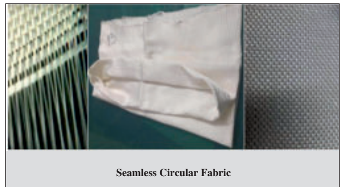
Seamless Circular Fabric

Project completion report has been submitted to Office of Textile Commissioner, Mumbai for their evaluation and approval. PAMC and PAC meeting have been successfully conducted. Release of final instalment is awaited.