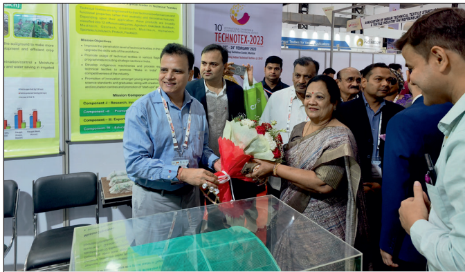
Smt. Darshana Jardosh, Hon'ble Minister of State for Textiles visited SASMIRA Stall during Technotex 2023